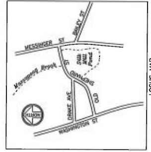
LOCUS MAP N.T.S.

3. PLAN DATUMS: MA MAINLAND 2001, NGVD29